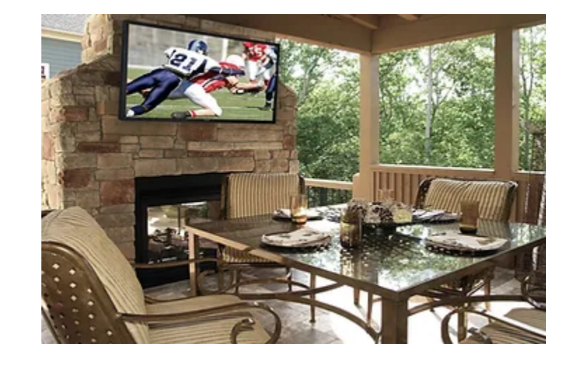
Even in a partially closed in space, an Outdoor TV is needed

Some might think about using a standard indoor TV, outside. However, installing a TV that is designed for outdoor usage is the best solution for various reasons: First, most LED TVs have an operating temperature range of 50 to 100 degrees Fahrenheit. This range isn't suitable for Chatham, winters or most summers days. Second, standard TVs are not made for high