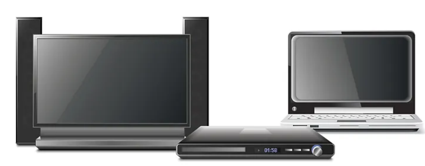
What Devices Need Software Updates?

Hardware will not run at its peak performance, security will be more easily breached, and compatibility with new products will wane.