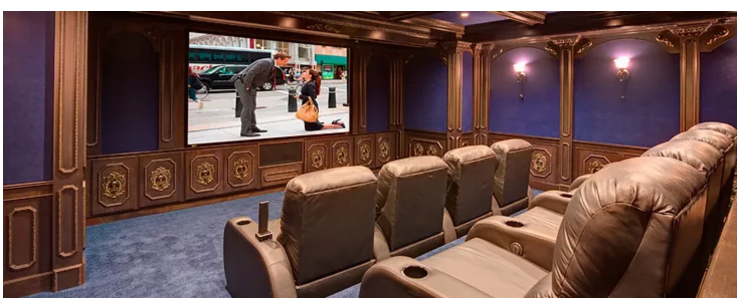
What Is Kaleidescape?

Everything you need to know about Kaleidescape.