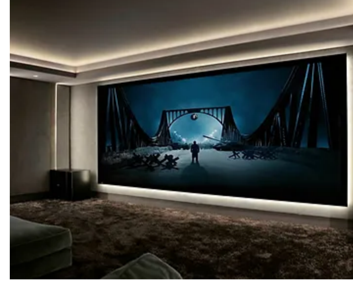
Home Theater Specialist In New Jersey

If you're in the process of searching for an audio-video specialist for building or renovating a home theater at your house, you have plenty to consider. You need a professional that not only is going to take your vision and convert it into reality but also will handle your project with expertise, care and detailed communication throughout the process. Finding the right company for the home theater installation at your house in Chester or throughout the northern New Jersey area can be a difficult process. How do you know you will be making the right choice? Bravo AV is here to help. In this blog entry, the first of a three-part series, we detail what you should be looking for in a home theater specialist and why Bravo AV's customer-centric approach, experience, and technical knowledge make it stand out from other home theater companies.