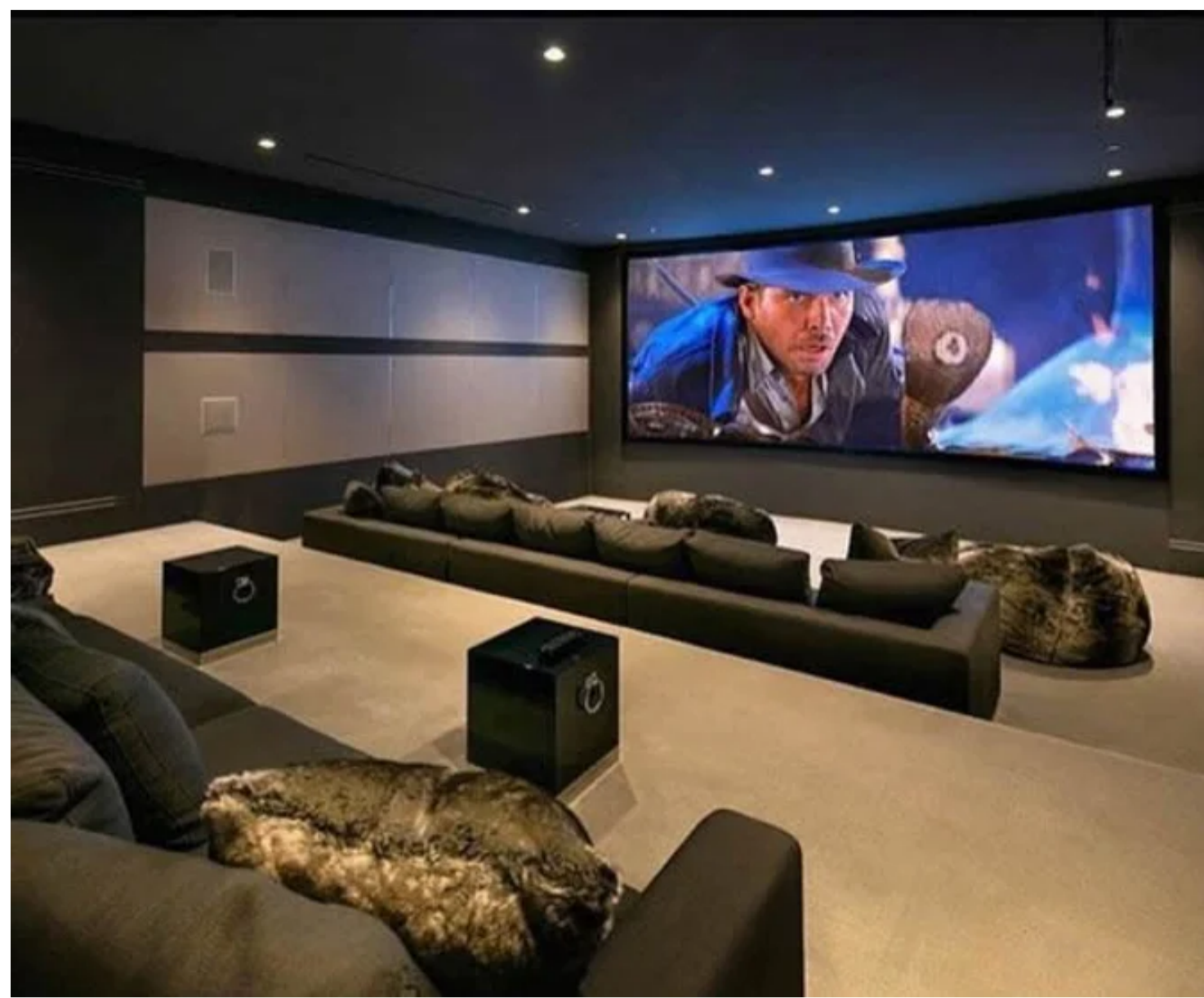
Introduction To A Dedicated Home Theater Room

Start here to learn everything about Home Theater