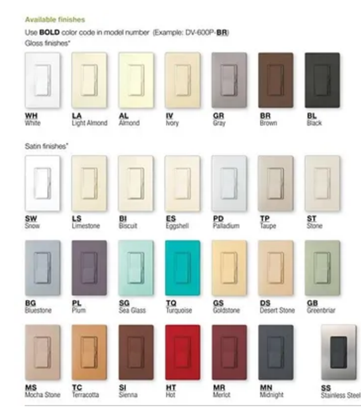
Radio Ra2 Dimmer Color Options