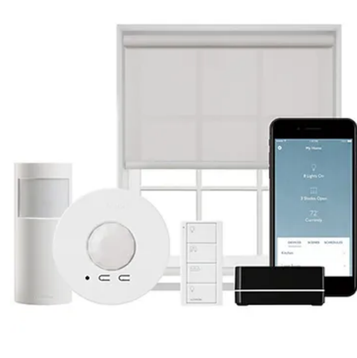
Lutron Radio Ra2 Product Line Up

RadioRA 2 is a complete lighting control system. It includes a variety of keypads, light switches, electric switch control, appliance control, sensors, and more to build a complete solution. Lutron also has smart thermostat and motorized shade solutions that can integrate with the lighting control. However, if you wish to use different solutions for those, RadioRA 2 works with a large variety of home automation solutions.