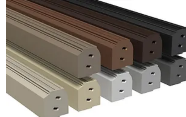
Outdoor Shades By Screen Innovations Zen Box Series

The Screen Innovations Zen Box is excellent for retrofit applications. The box can be mounted on external walls with minimum modifications. Various shade materials are available depending on your preferences and exposures. The Tough screen, for example, allows for 30% openness to light. The Sheerweave fabric has a less reflective, matte finish. It filters more light, with a 5 to 10% openness factor. The Suntex fabric provides more weather resistance, resisting mildew, and fade. Finally, the Serge Ferrari premium fabrics are also available that provide commercial-quality protection that has been proven in business installations around the world. How do these shades stack up to wind? While they are designed for use in wind conditions under 20 miles per hour, a high-quality stainless steel cable guide keeps them in place in mild conditions. A breezy outdoor meal can be perfectly under control with these shades in place. The maximum size of a Zen Box shade is 18 feet wide by 16 feet tall.