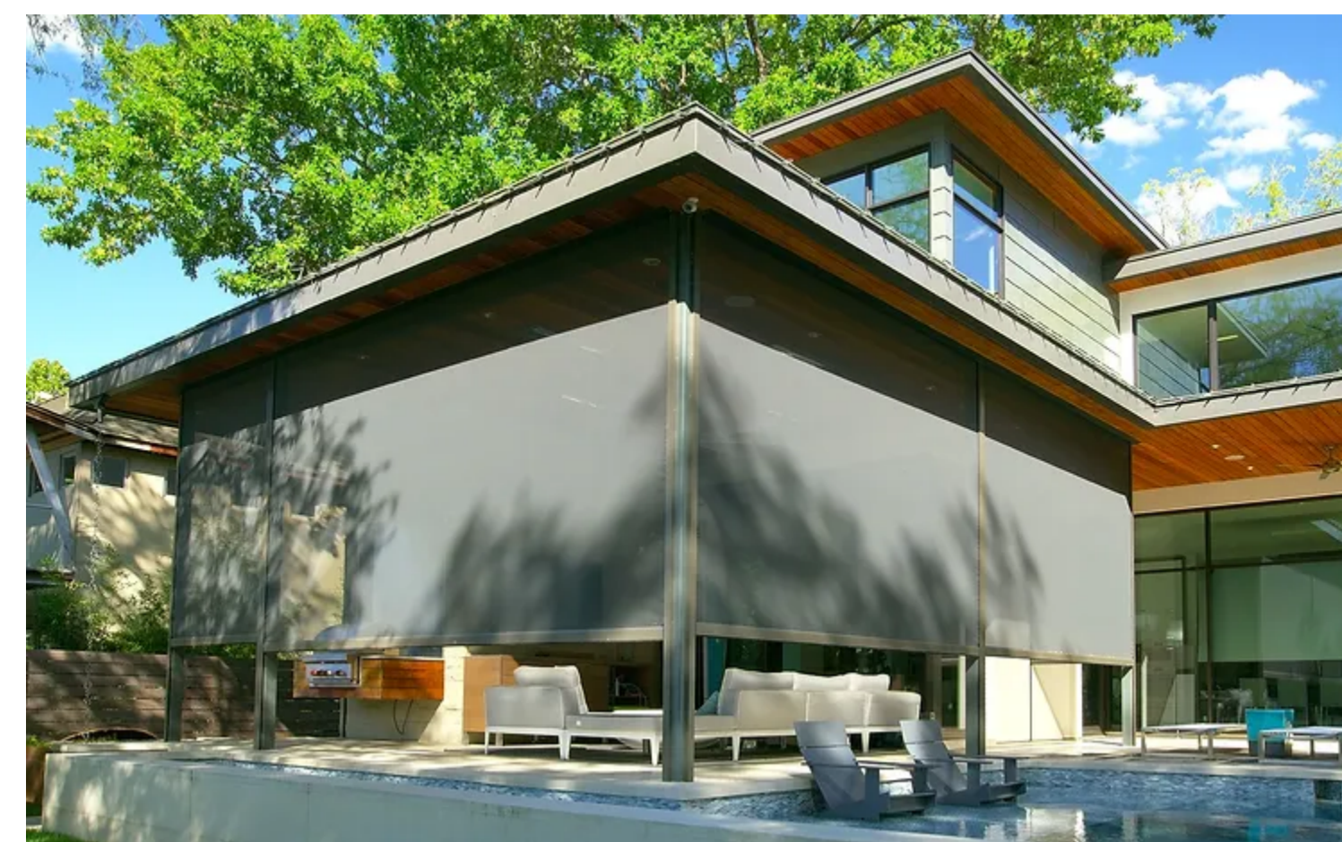
Introduction To Outdoor Shades

Start here to learn everything about outdoor shades.