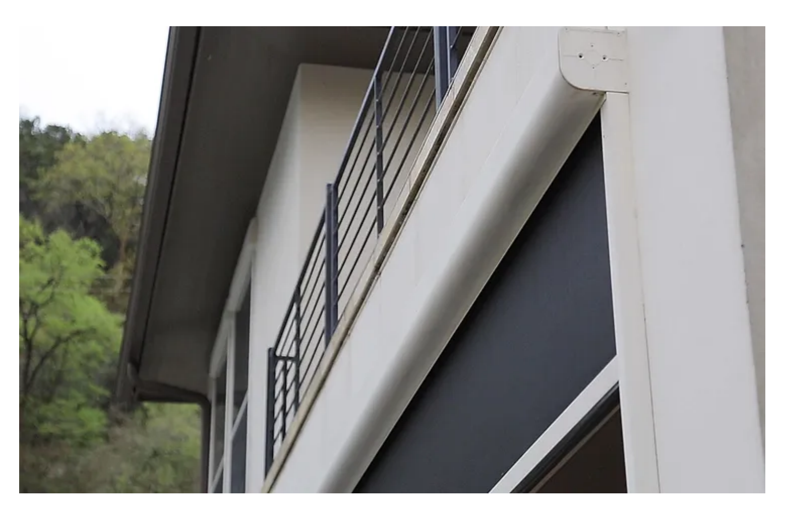
Outdoor Shade Benefit: No Bugs I No Wind

While we're fortunate not to have too many insects in the spring and summer in New Jersey, they are here nonetheless. Outdoor sun shades can help keep bugs out of your patio area by enclosing it. You may not keep them all out, but you will certainly have them under control, especially for when you and your family enjoy meals outside.