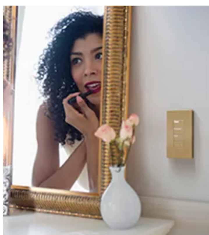
Voice Control Allows You To Multi-Task

Often, when we're in the kitchen, the sun is in transition. In the evening, as the sun is setting, the awkward angles can create uncomfortable glares. If you have motorized shades , you can have them set to a sensor to descend just in time to prevent that from happening. But when the shades go down, you'll need more light. Now, you want to adjust your lights, but your hands are full. All you have to do is ask for more illumination, and you're back in business.